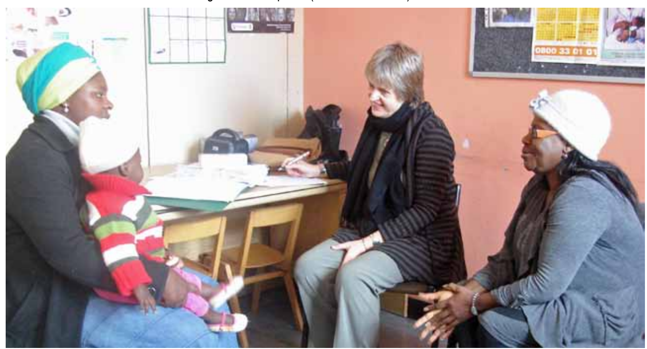
The author working with an interpreter (and cultural broker) in a South African clinic.

Offering a space in which confidentiality is assured, and where the mother is able to think and make links is often all that is needed to gain awareness and insight. In this way behaviour changes and the child is provided with a predictable, developmentally appropriate response in the feeding situation. Not only may this lead to a more robust weight gain, but it will also lay the basis for a more secure relationship between infant and caregiver which is the beginning of mental health for all.