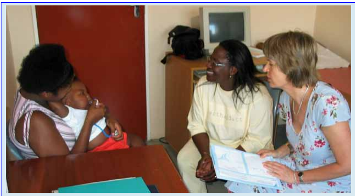
Faltering weight in primary health care

The University of Cape Town Parent-Infant Mental Health Service is based at the local children's hospital and as part of its outreach programme provides a clinical service to a large township on the outskirts of the city. A child psychiatrist, together with a community counsellor who also acts as interpreter and cultural broker, visit the same well-baby clinic on a weekly basis. It is known as the "Mdlezana Centre".