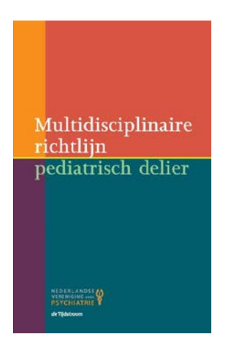
Click on the image (and select "Multidisciplinaire Richtlijn pediatrisch delier') to access the Dutch Multidisciplinary Guideline for Pediatric Delirium (in Dutch)

Can these findings from adults be extrapolated to children? There is limited evidence that this is the case. However, common sense suggests that these interventions (for example promoting orientation and day-night rhythm, and avoiding overstimulation by light and sounds) may be effective for children as well.