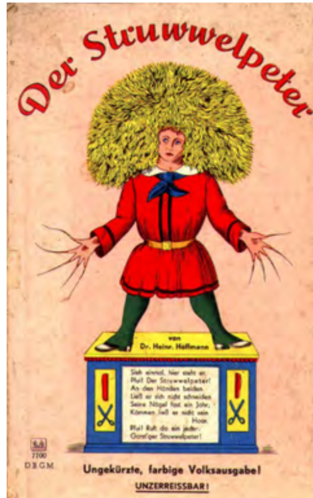
Der Struwwelpeter , an illustrated book portraying children misbehaving (“Impulsive Insanity/Defective Inhibition”) by Heinrich Hoffman (1854).

Does prevalence vary according to country? Did it increase in the last few decades? Previous meta-analyses show that prevalence neither varies by geographic region nor by the time of publication of the studies (Polanczyk et al, 2007, 2014).