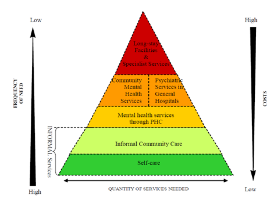
Figure J.5.1 The optimal mix of services pyramid (WHO, 2007)

Community-based and informal care consists of services provided mainly by peers, parents, school staff and influential community members. They play a major role especially in terms of community sensitization on mental health needs, promotion of attitudinal changes and promotion of psychosocial well-being.