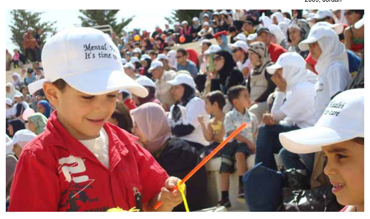
World Mental Health Day 2009, Jordan

Specialists in child mental health (pediatricians, mental health nurses, psychiatrists, neurologists, child psychiatrists) require adequate skills to work