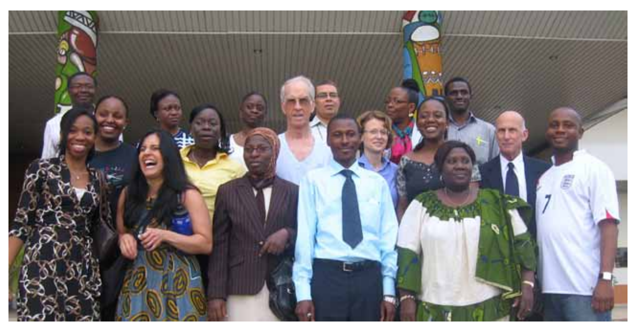
Attendees and Faculty, IACAPAP Study Group in Abuja, Nigeria, 2010

Community-based health workers may also be engaged in the delivery of services relevant to child mental health and they can be considered an "extension" of the primary care services. Human resource policies have to consider the specific training needs and incentives for peers, parents, teachers, community leaders, and community health teams according to their respective roles.