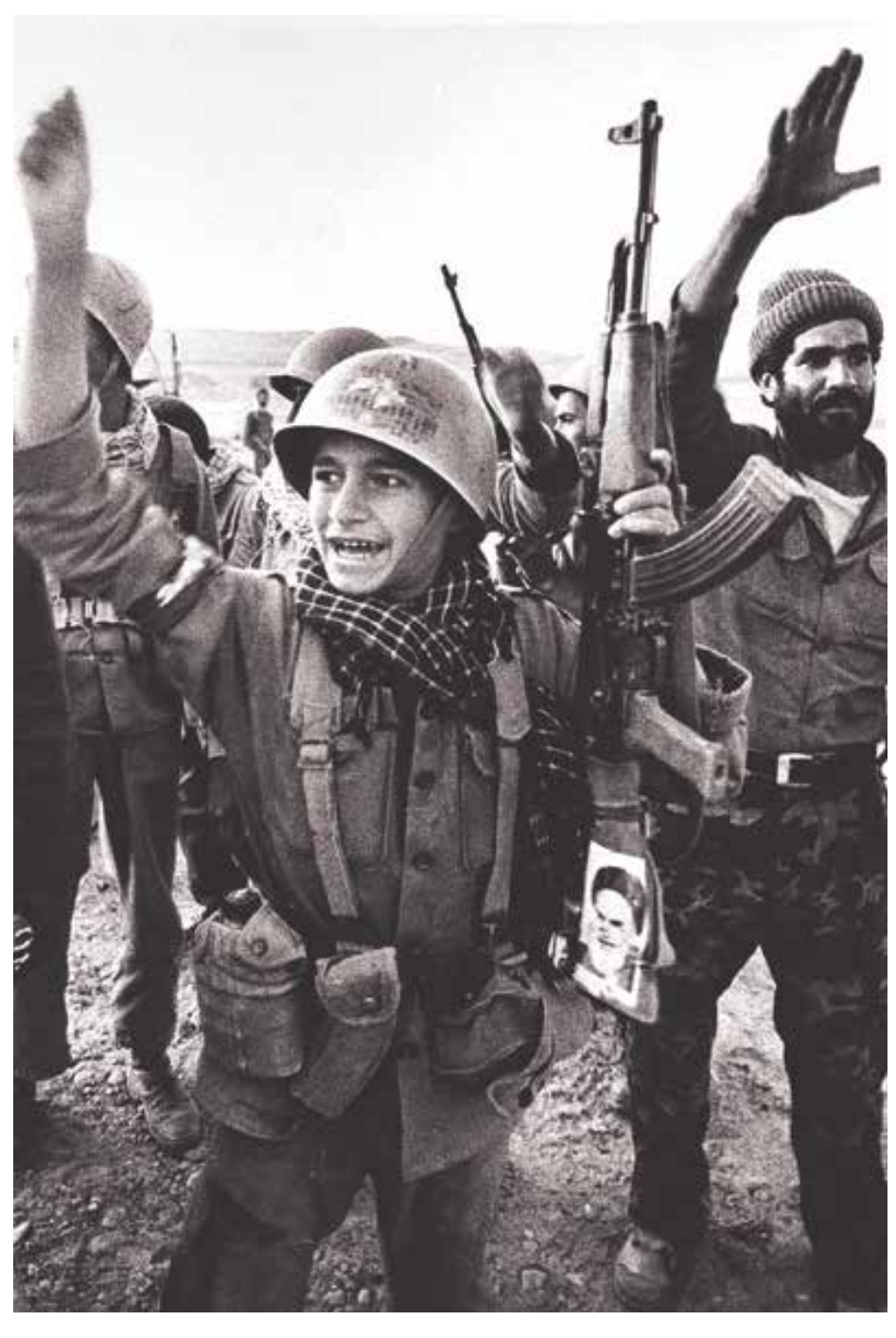
Iranian soldier during Iran-Iraq War.

Similar to PTSD and ASD, adjustment disorders require exposure to a stressful event, which results in clinically significant distress or impairment. However, in adjustment disorders, the stressor does not need to be "traumatic" (i.e., as severe as for ASD or PTSD). FFurther, adjustment disorder does not specify required symptoms and the patient's condition should not be explained by another disorder.