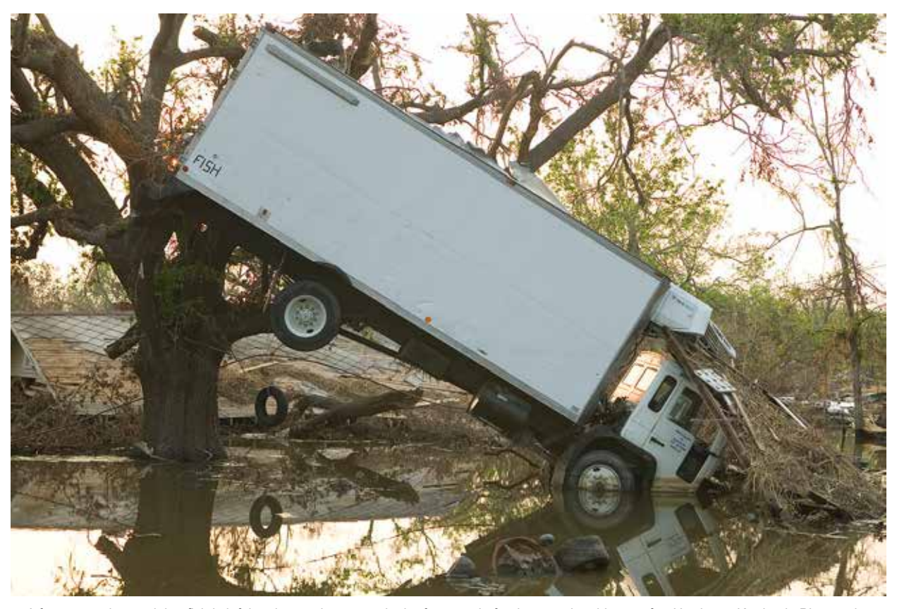
A freezer truck containing fish is left leaning against a tree in the front yard of a destroyed residence after Hurricane Katrina in Plaquemines Parish, Louisiana, US.

Although evidence-based treatment approaches including CBT adapted to culture-bound syndromes, eye movement desensitization and reprocessing (EMDR) and narrative exposure therapy are useful to alleviate PTSD symptoms among young refugees, a holistic approach is usually also necessary (Papadopoulos, 1999). Because they are under important social and material stress, young refugees frequently need to discuss current practical difficulties rather than past experiences. Finally, they may also wish to focus on the future rather than reflect on the past, and such a focus should not be discouraged (Beiser & Hyman, 1997).