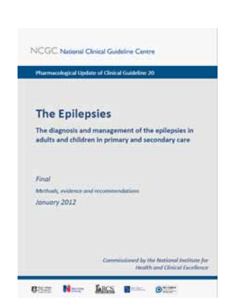
Click on the picture to access the NICE guidance on the diagnosis and management of the epilepsies in adults and children.

As the clinical manifestations of nocturnal frontal lobe seizures often include prominent tonic or motor manifestations, they are more likely to be noticed by the patient or family than complex partial seizures of temporal lobe origin – complex partial seizures that begin focally and impair consciousness are the predominant seizure type in temporal lobe epilepsy. However, the brevity, the minimal or lack of postictal confusion, the apparently psychogenic features (such as kicking, thrashing and vocalizations), and the frequently normal interictal and ictal recordings may